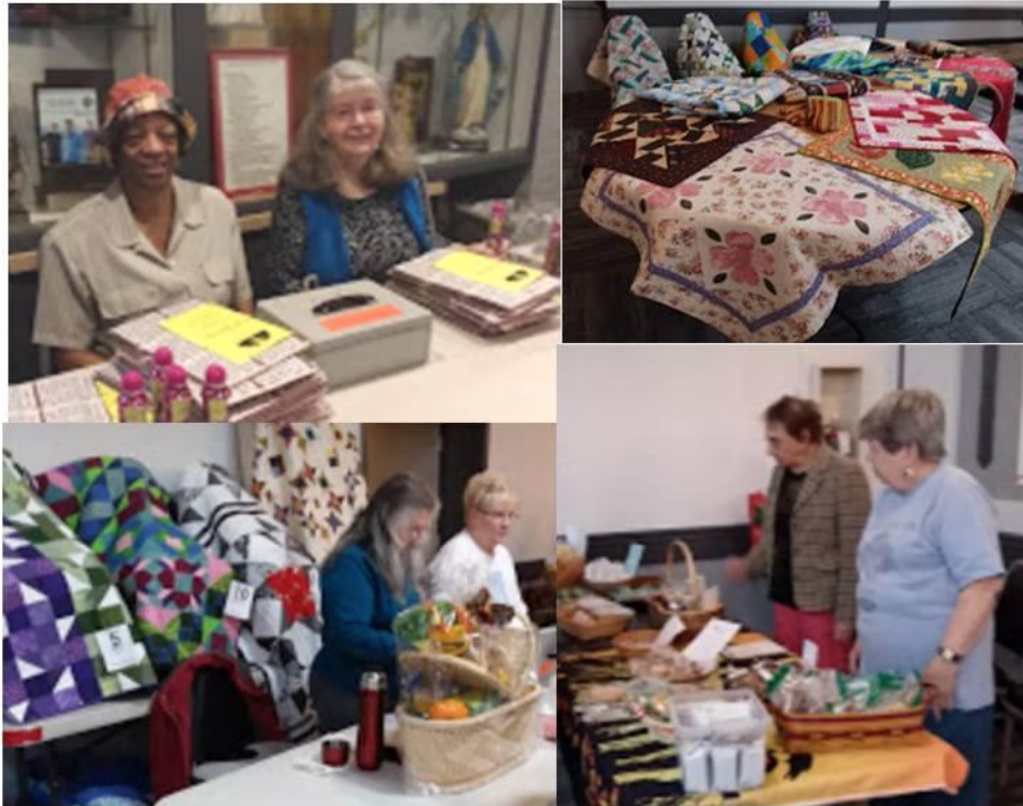
Southern Comforters helping at our 2018 Quilt Bingo