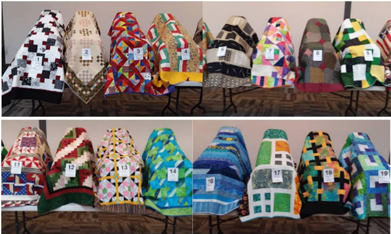
What beautiful Quilt Bingo prizes!