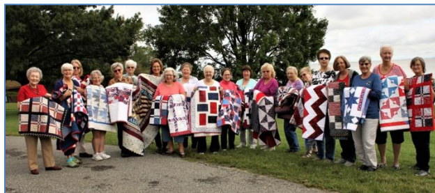
Members of the Downs Park Quilters